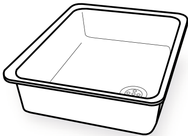
ADA DropIn® Sink

-sink supports. Top mounting also elevates the already shallow sink bottom by about 1". All outside edges and corners have been rounded for the user's comfort and protection and all ADA DropIn sinks feature space saving rear corner drains to move plumbing to the back of the cabinet.